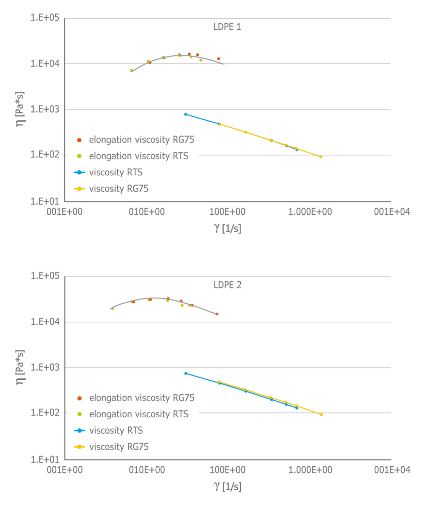
Figure 3: Comparison of shear and elongation viscosity between online and laboratory measurements of two LDPE